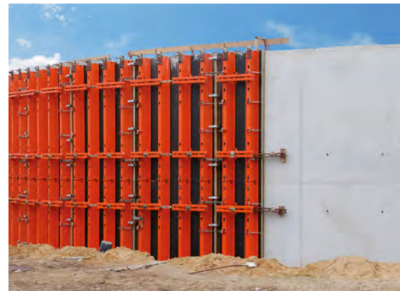
The circular formwork system with clamp connection technology in use on the construction site is impressive.