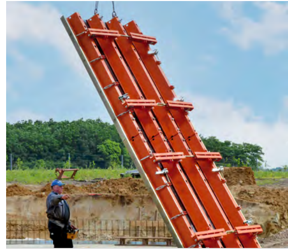
The clamps are „parked“ on the segment when dismantling and are immediately at hand for the next use.

Continuous height offsetting between the individual segments is possible, allowing the formwork to be perfectly adapted to sloping ground.