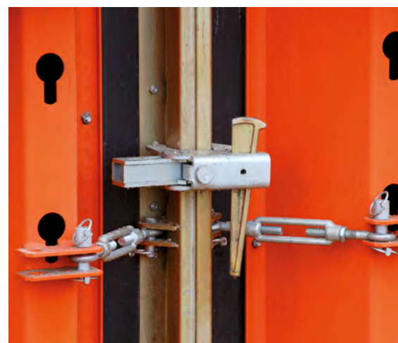
The TTK multi clamp permits formwork down to the last centimetre and ensures a tight and flush joint.